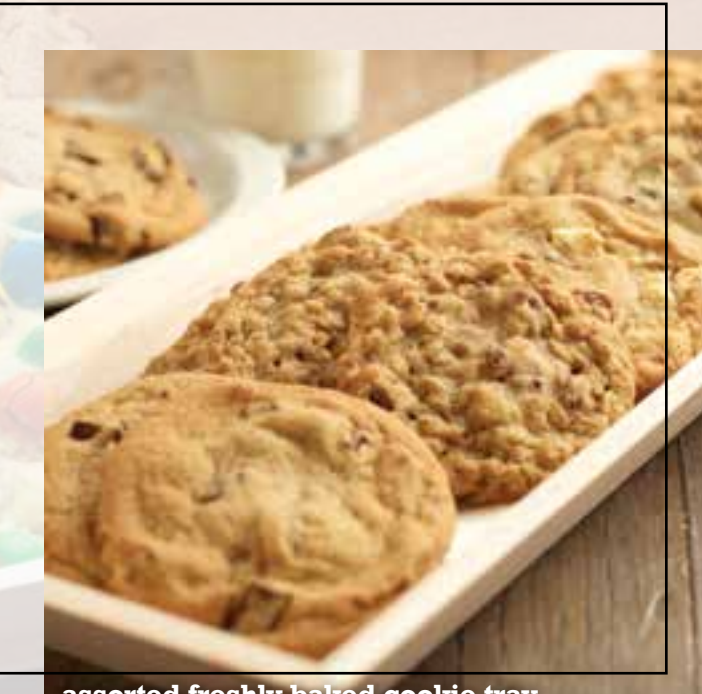
assorted freshly baked cookie tray

vanilla ice cream, fresh strawberries, blackberries, red raspberries, blueberries, maraschino cherries, chocolate, caramel & butterscotch served with an assortment of toppings & whipped cream 7 per person