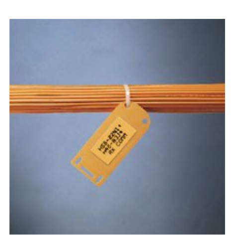
Example of label